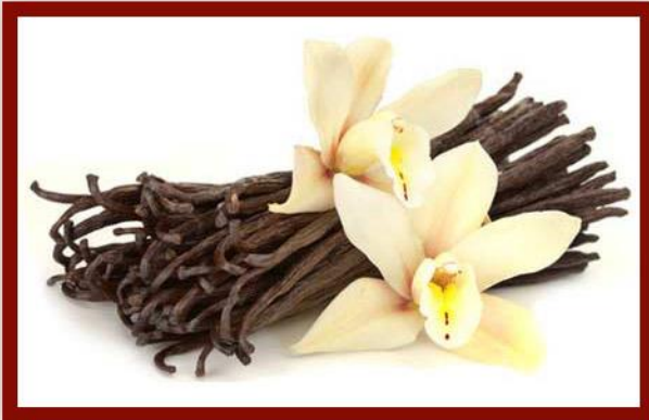
VANILLA VANILLA PLANIFOLIA ANDR