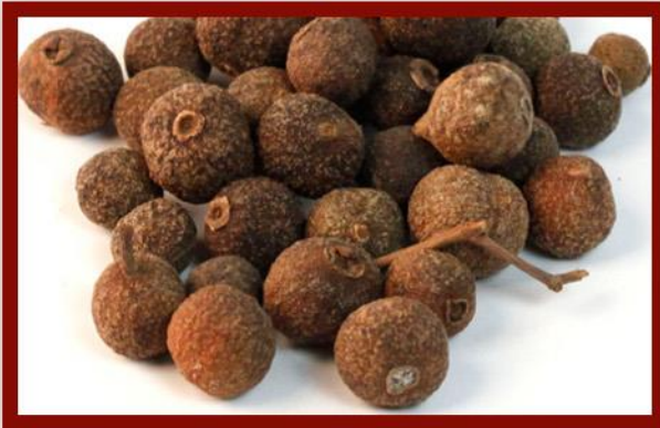
ALLSPICE PIMENTA DIOICA