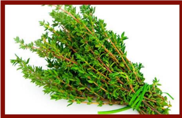
THYME THYMUS VULGARIS