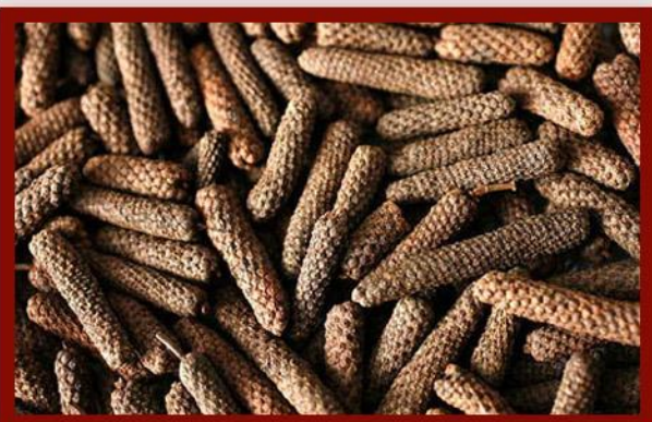
PEPPER LONG PIPER LONGUM