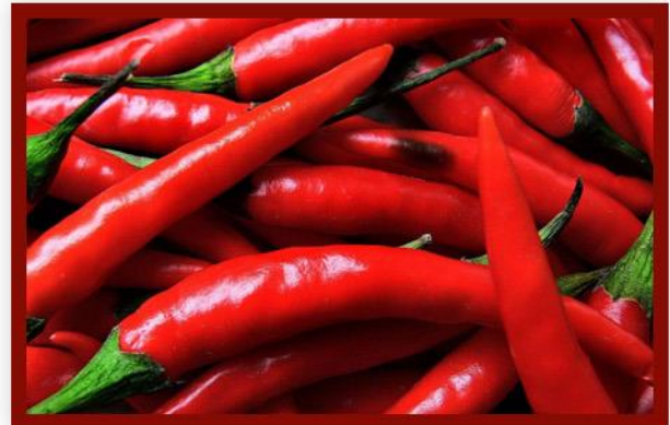
CHILLI CAPSICUM ANNUUM