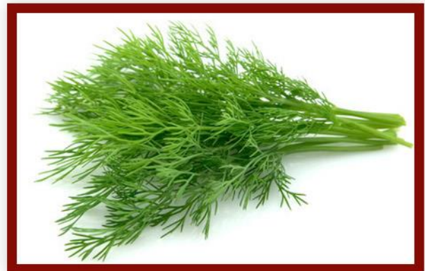
DILL ANETHUM GRAVEOLENS