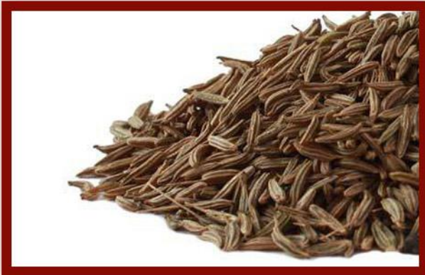
CARAWAY CARUM CARVI