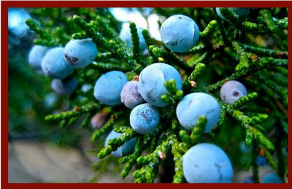
JUNIPER BERRY JUNIPERUS COMMUNIS