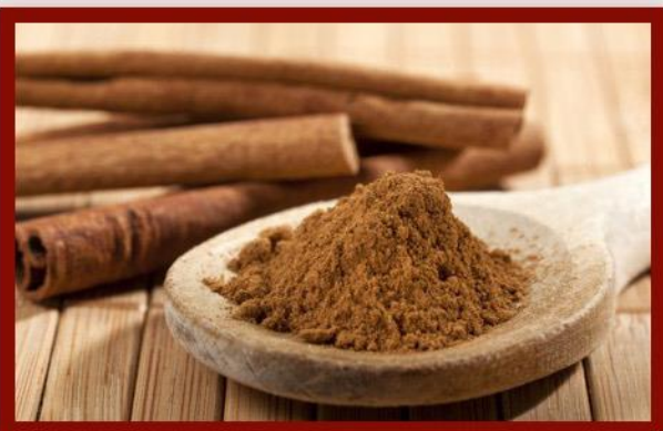
CINNAMON CINNAMOMUM ZEYLANICUM BREYN