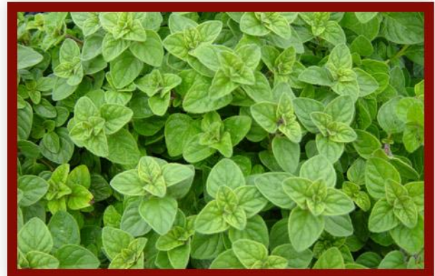
OREGANO ORIGANUM VULGARE