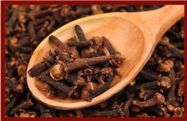
CLOVE SYZYGIIUM AROMATICUM