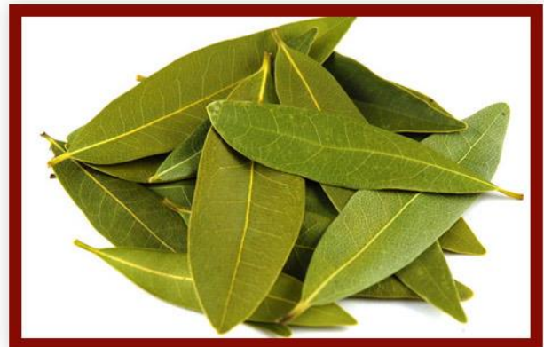
BAY LEAF LAURUS NOBILIS