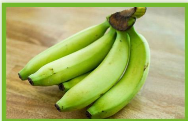
UNRIPE RAW BANANA