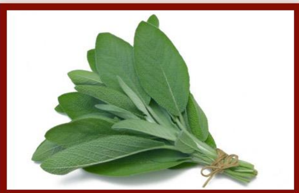
SAGE SALVIA OFFICINALIS