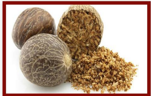
ASAFOETIDA FERULA ASAFOETIDA