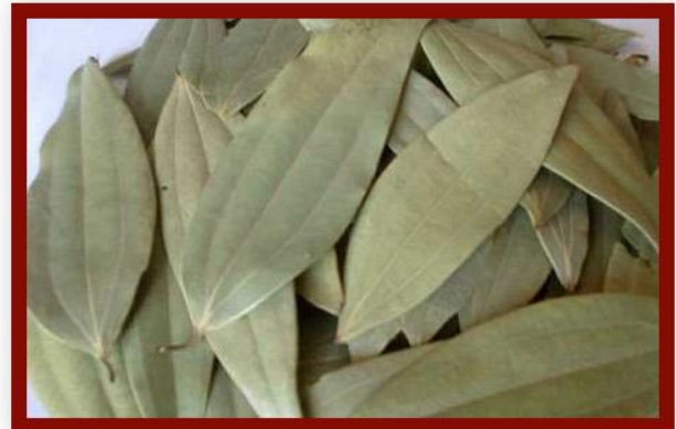
TEJPAT CINNAMOMUM TAMALA NEES & EBERUM