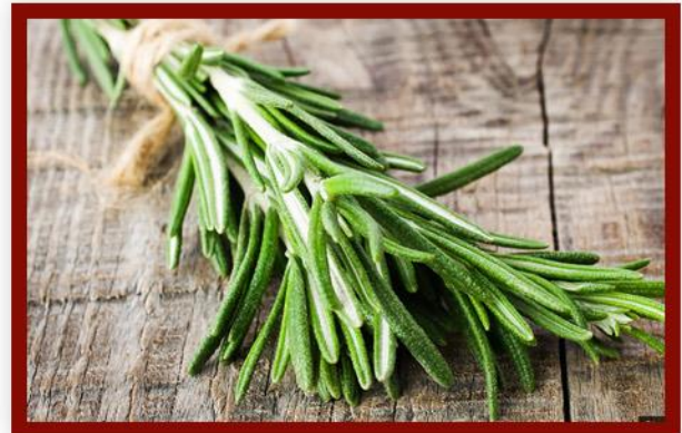
ROSEMARY ROSMARINUS OFFICINALIS