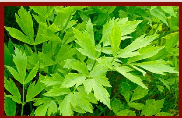
LOVAGE LEVISTICUM OFFICINALE KOTH