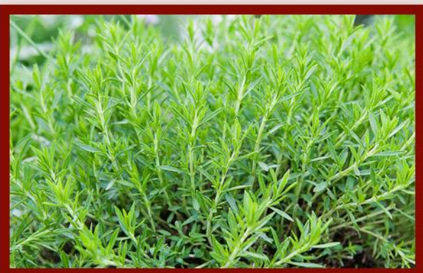
TARRAGON ARTEMISIA DRACUNCULUS