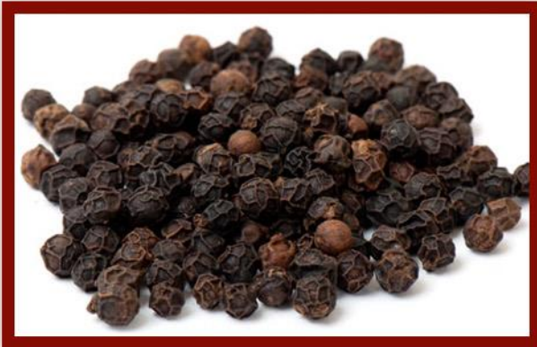
PEPPER PIPER NIGRUM