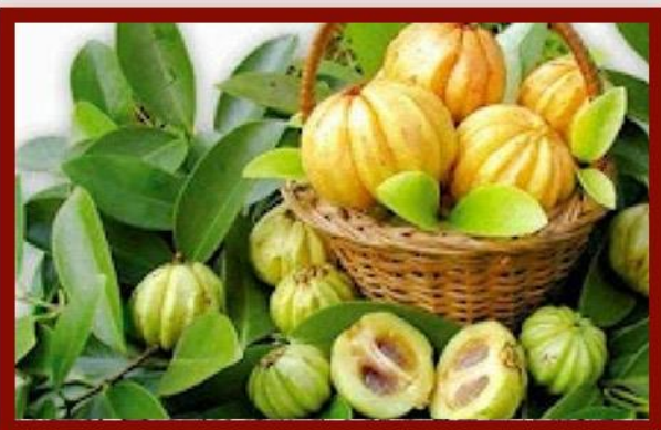
CAMBOGE GARCINIA CAMBOGIA