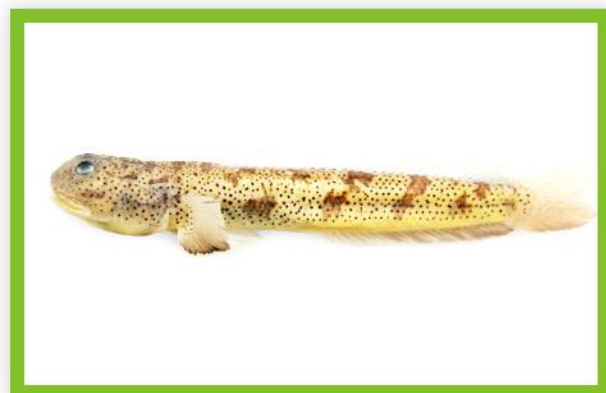
RAJUA APOCRYPTES SPP