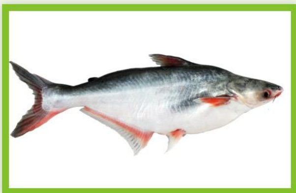
PUNGUS PANGASIUS PANGASIUS