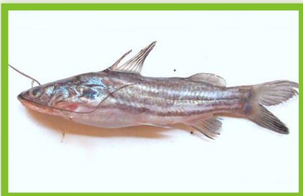
TENGRA MYSTUS VITTATUS