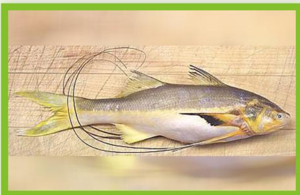
TAPOSI POLYNEMUS PARADISEUS