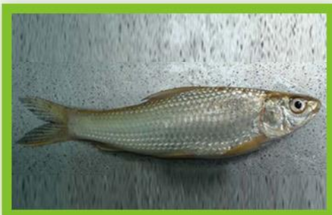
BATA LABEO BATA