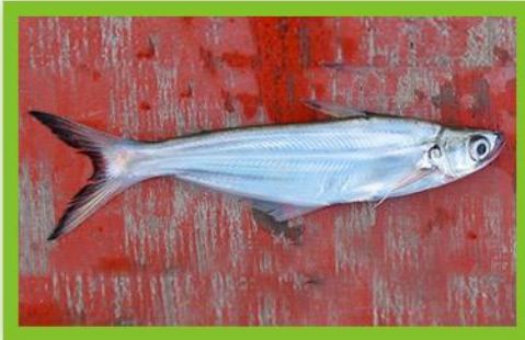
BACHA EUTROPIICHTHYS VACHA