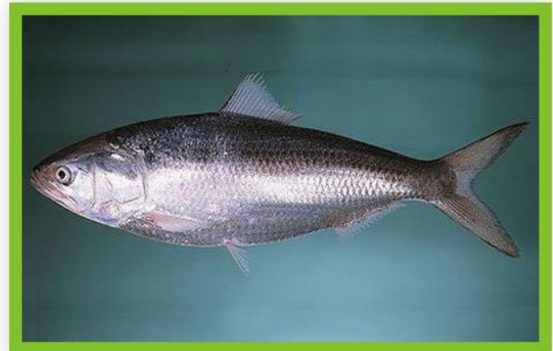
HILSHA EGG TENUALOSA ILISHA