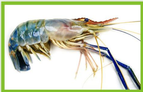
FRESH WATER GOLDA