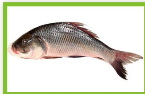
KATLA CATLA CATLA