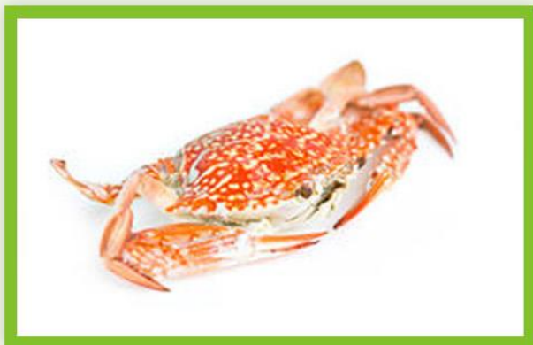
BLUE SWIMMING CRAB POR TUNUS PELAGIC