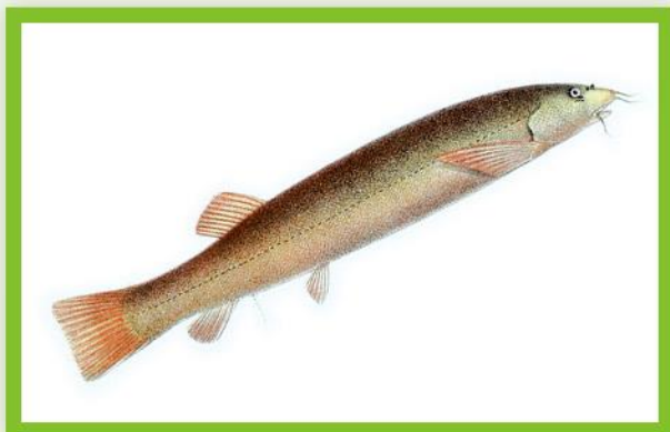
BUTTUM LEPIDOCEPHALUS GUNTEA