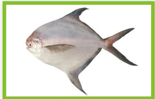
SILVER POMFRET PAMPUS ARGENTEUS