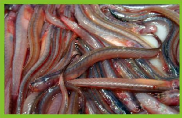
NONIA GURA TAENIOIDES APP