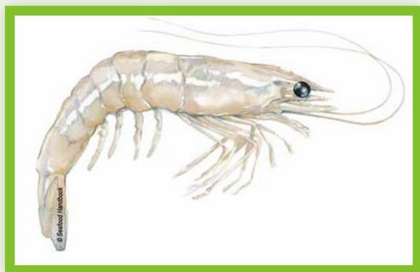
WHITE SHRIMP PENAEUS INDICUS