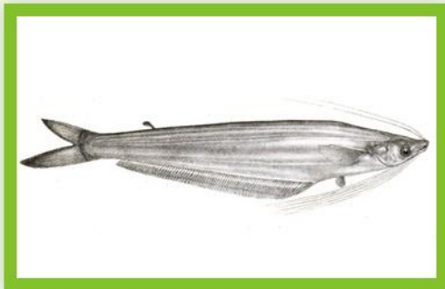
BASPATA AILIA COILA