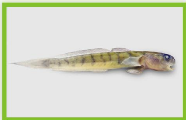
CHIRING APOCRYPTES BATO