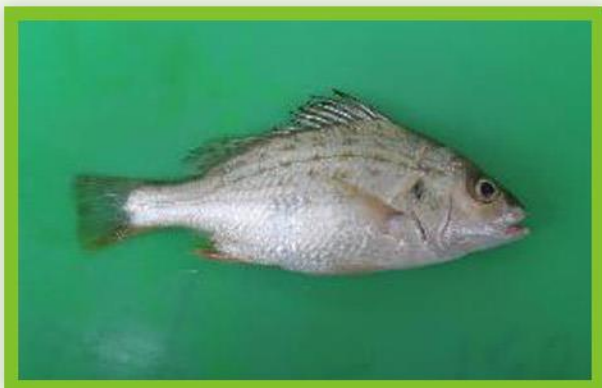
DATINA KORAL POMADASYSS HASTA