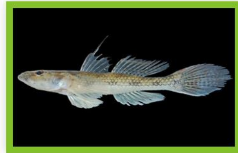
BAILA GLOSSOGOBIUS GIURIS