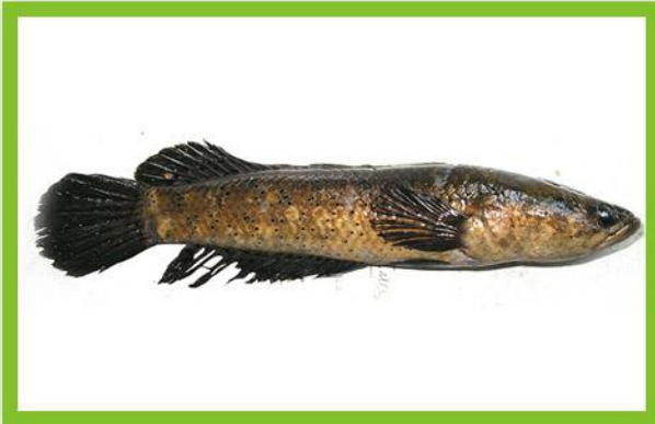
TAKI CHANNA PUNCTATA