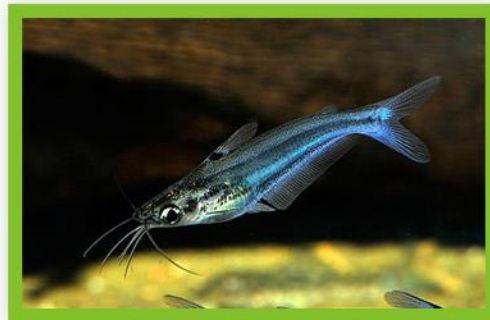
BATASHI PSEUDEUTROPIUS ATHERINOIDES