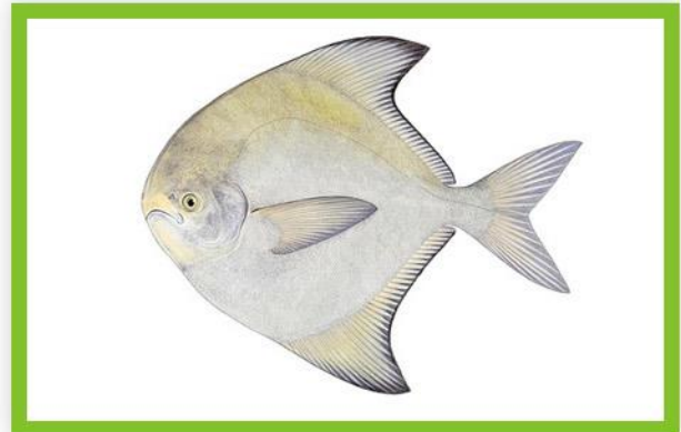
CHINESE POMFRET PAMPUS CHINENSIS