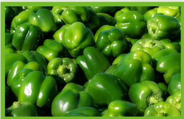
GREEN BELL PEPPER