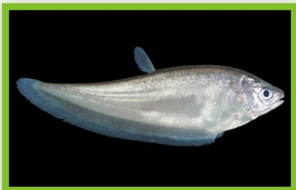
FOLY NOTOPTERUS NOTOPTERUS