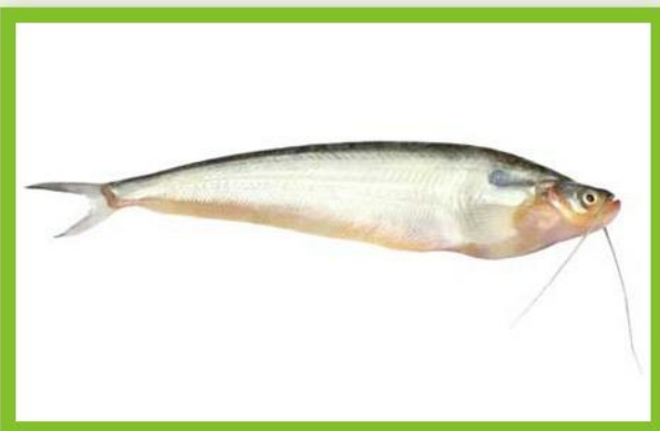
PABDA OMPOK PABDA