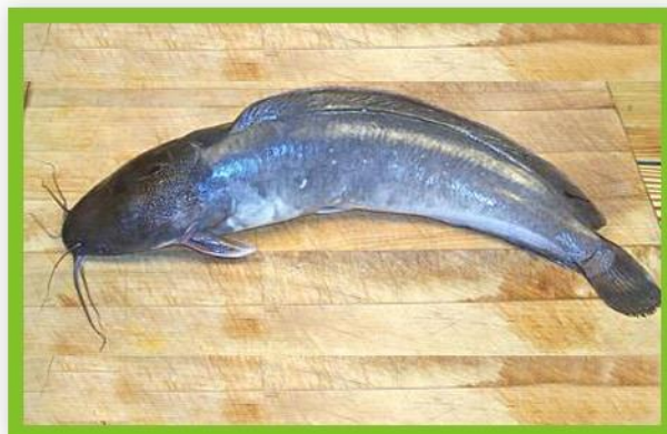
DESHI KORAL CLARIAS BATRACHUS