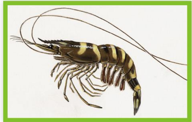
OCEAN TIGER PENAEUS MONODON