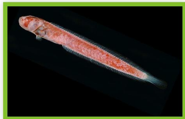
FUL CHIRING TRYPACHEN VAGINA