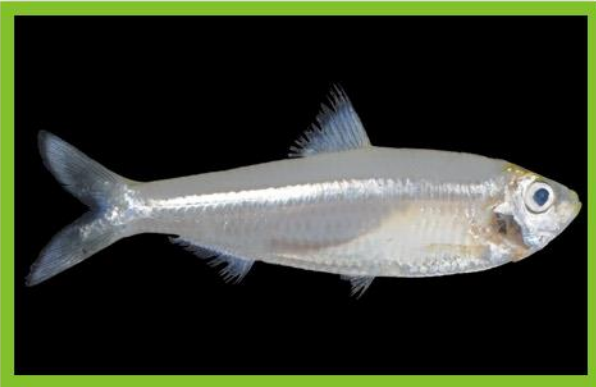
HICHIRI ESCUALOSA THORACATA