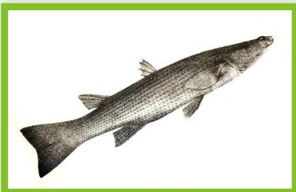
CHOKKO BATA MUGIL CORSULA