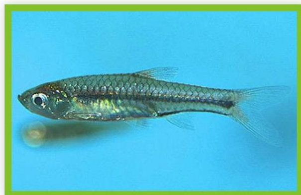
CHALAPATA SALMOSTOMA BACAILA