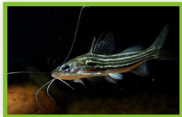
BOZORI MYSTUS TENGARA