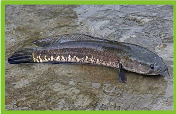
SHOIL CHANNA STRIATA