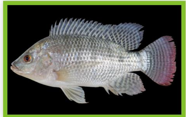
TELAPIA OREOCHROMIS NILOTICUS