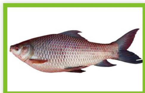
RAHU LABEO ROHITA