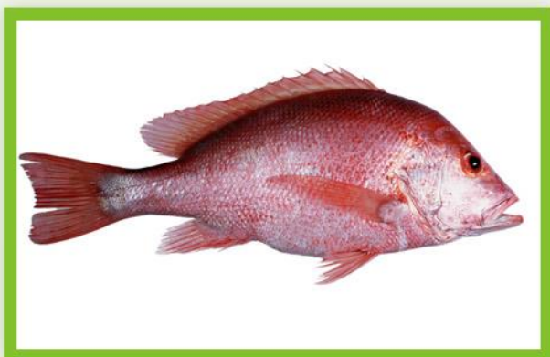
RED SNAPPER LUTJANUS MALABARICUS