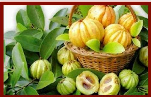
CAMBOGE GARCINIA CAMBOGIA