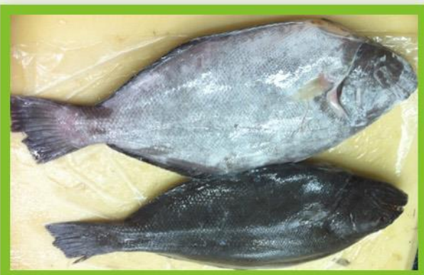
INDIAN HALIBUT PSETTODES SPP