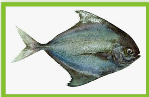
BLACK POMFRET PARASTROMATEUS NIGER